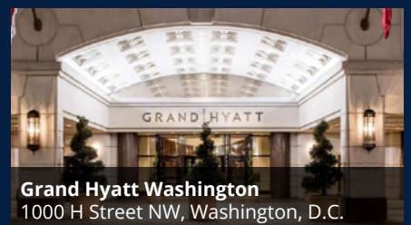
Grand Hyatt Washington 1000 H Street NW, Washington, D.C.